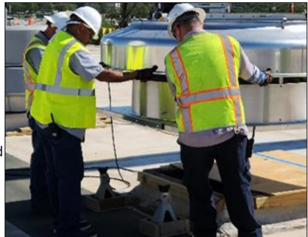
Technicians Install new Central Utility Plan Exhaust Fans at Ft. Cavazos, Texas, Military and Family Support Center.

U.S. Army Corps of Engineers – Engineering and Support Center, Huntsville P.O. Box 1600, Huntsville, AL 35807 Public Affairs Office 256-895-1694 www.hnc.usace.army.mil